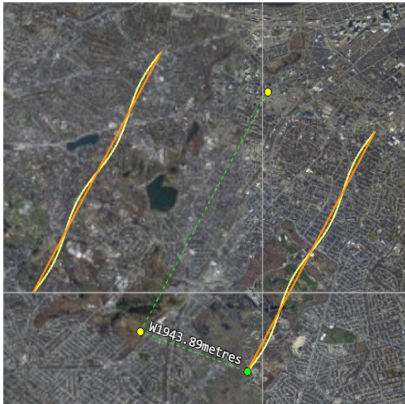
Figure: Editing buffer-based military symbols