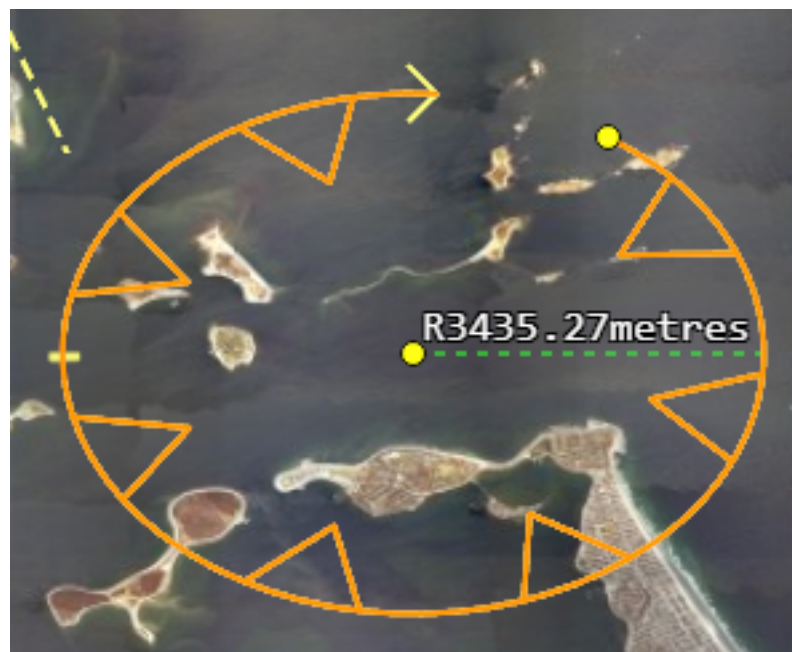
Figure: Editing circle-based military symbols